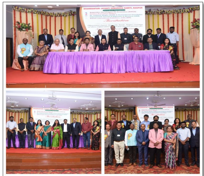
Pic :Last Year 5th November 2023 Award Function